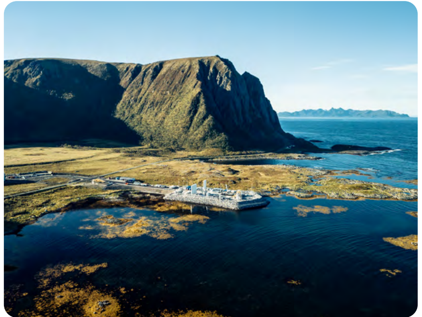
Isar Aerospace launch complex at Andøya Space

Mission ‘Onward and Upward’ will launch from Isar Aerospace’s launch complex at the Andøya Space launch site located in Andøya, Norway. Officially opened by the end of 2023, Andøya Space is the first operational orbital spaceport in continental Europe.